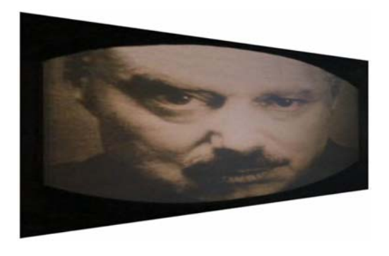
Fig. 3. Transformed frame of a video clip, when the user views it under 30° angle from the right (Big Brother from the film after George Orwell's novel 1984)

At the end we deform the projected image of the face in such a way that it looks undeformed from the viewpoint of the observer (Fig. 3).