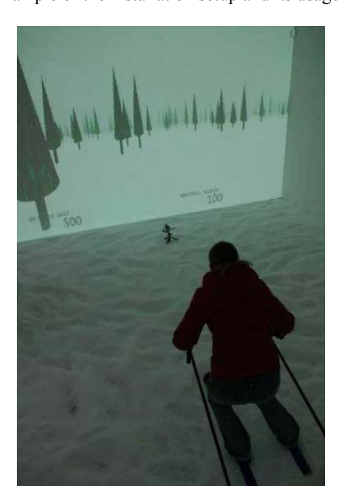
Fig. 4. Immersion in the Virtual Skiing installation

An interactive installation Virtual Skiing [4] enables a visual immersion into the feelings of gliding on snow through a winter landscape. The computer rendered winter landscape is displayed over the entire wall in front of the skier. As on real skis you can regulate the speed of descent by changing the posture of your body so that the air resistance is decreased or increased. By shifting the weight of your body to the right or left ski you can make turns down the slope between the snow capped trees. The interface to the virtual world is again implemented by computer vision techniques, which capture the posture of the skier's body. Fig. 4 gives an example of the installation setup and its usage.