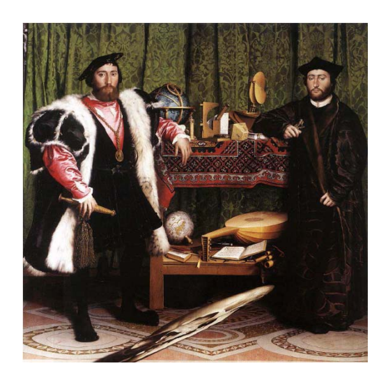
Fig. 2. On the bottom of the painting appears a diagonal blur, which appears as a human skull when viewed from the upper right (The Ambassadors by Hans Holbein)

In [3] we define the concept of dynamic anamorphosis. A classical or static anamorphic image requires a specific, usually a highly oblique view direction, from which the observer can see the anamorphosis in its correct form (Fig. 2). Dynamic anamorphosis adapts itself to the changing position of the observer so that wherever the observer moves, she/he sees the same undeformed image. This dynamic changing of the anamorphic deformation, in concert with the movement of the observer, requires from the system to track the 3D position of the observer's head and the recomputation of the anamorphic deformation in real time. This is achieved using computer vision methods which consist of face detection/tracking of the selected observer and stereo reconstruction of its 3D position while the anamorphic deformation is modeled as a planar homography. Dynamic anamorphosis can be used in the context of art installation, in video