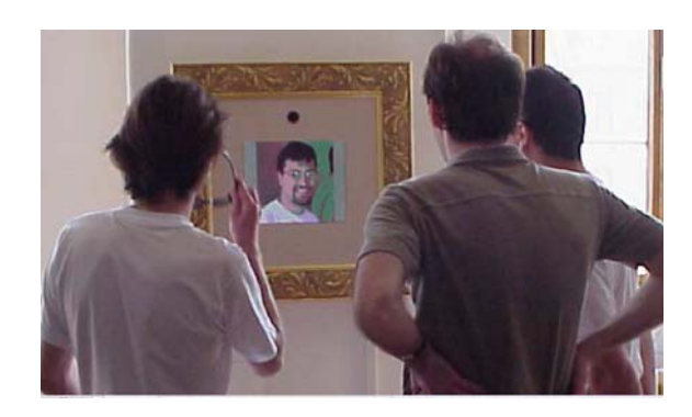
Fig. 1. People in front of the 15 Seconds of Fame installation

The visible part of the installation consists of a computer monitor framed like a painting. A digital camera is hidden behind the frame so that only a round opening for the lens is visible. Pictures of gallery visitors which are standing in front of the installation are taken every 15 seconds by the digital camera using a wideangle lens setting (Fig. 1). The camera is connected to a computer, which detects all faces in each picture, randomly selects a single face, makes a pop-art portrait out of it and displays it for 15 seconds on the monitor.