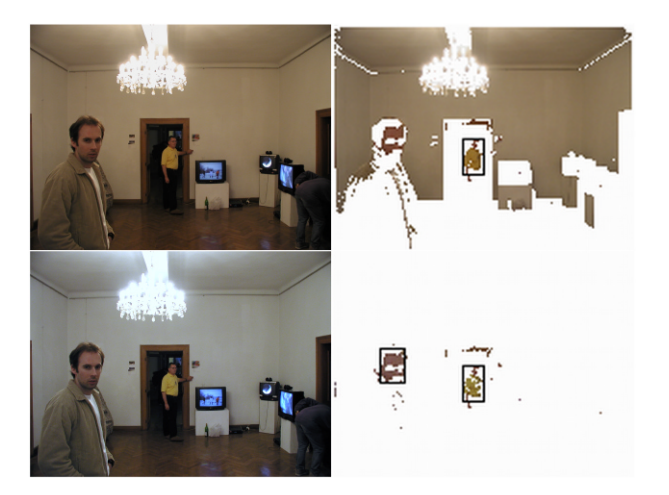
Figure 3. GW performance: the upper part of the figure shows how face detector failed to detect faces due to confusion caused by surrounding colors. This was improved by GW preprocessing as seen in the lower part of the picture. The image was chosen from the incandescent subset of images.

In order to determine the influence of these algorithms on our face detection results, some experiments were per-