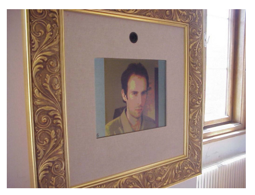
Figure 1. LCD computer monitor dressed up like a precious painting. The round opening above the picture is for the digital camera lens.

camera are built into the picture. Camera is connected to a computer, which controls the camera and processes captured images.